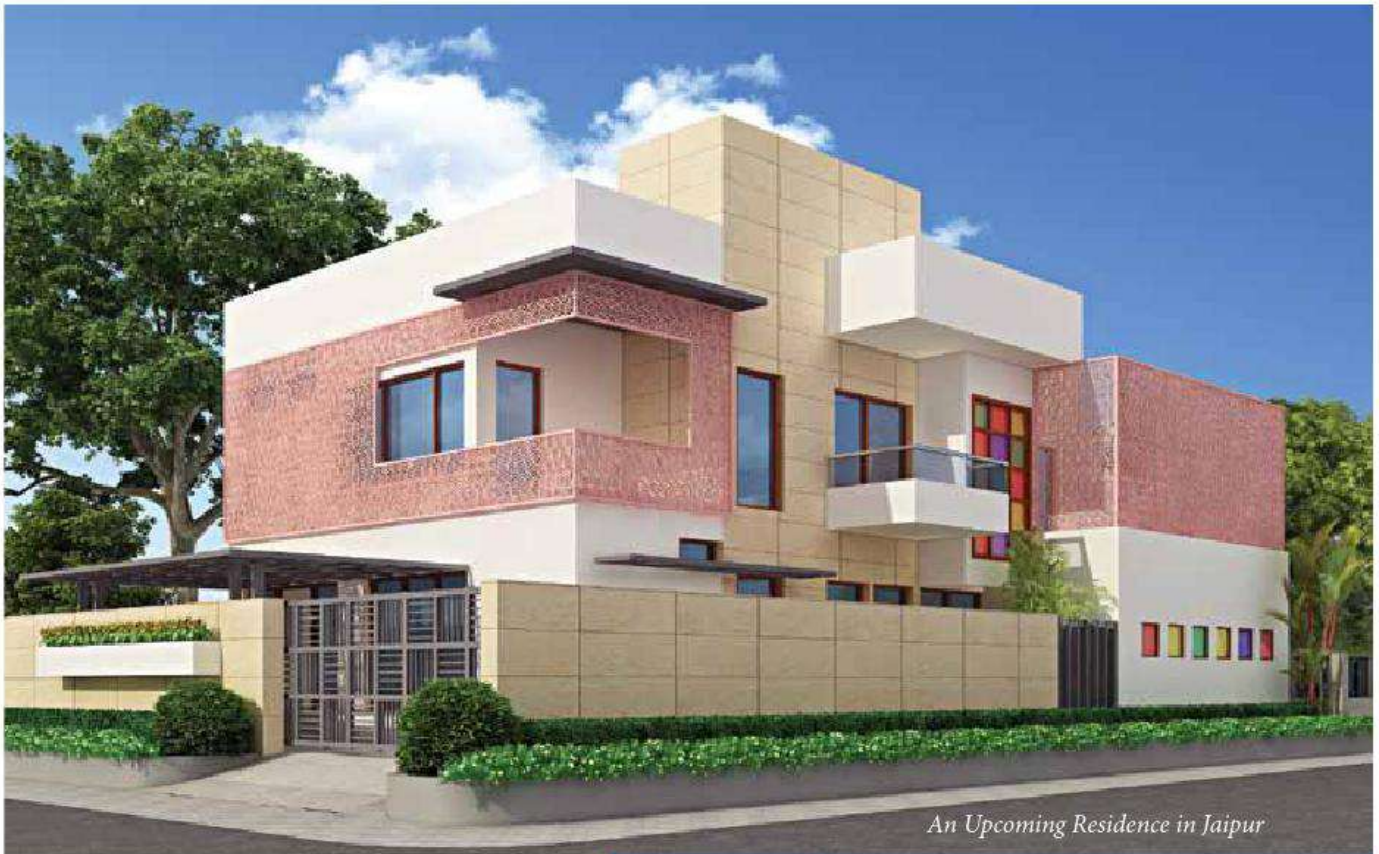
An Upcoming Residence in Jaipur