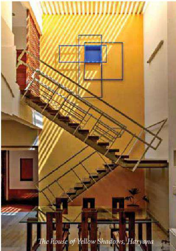
The house of Yellow Shadows, Haryana