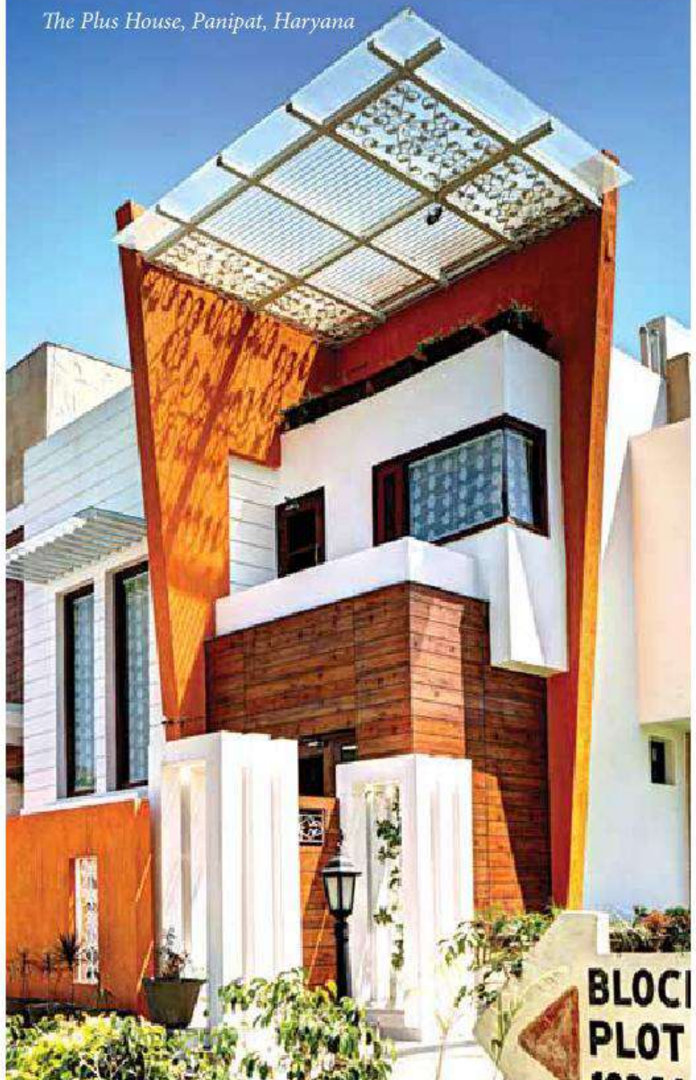
The Plus House, Panipat, Haryana

The name of our firm An-V-Thot is a hybrid of two words, anvit (Sanskrit) & thought (English) where “anvit” means “followed by”. Here’s a Studio followed by a thought.